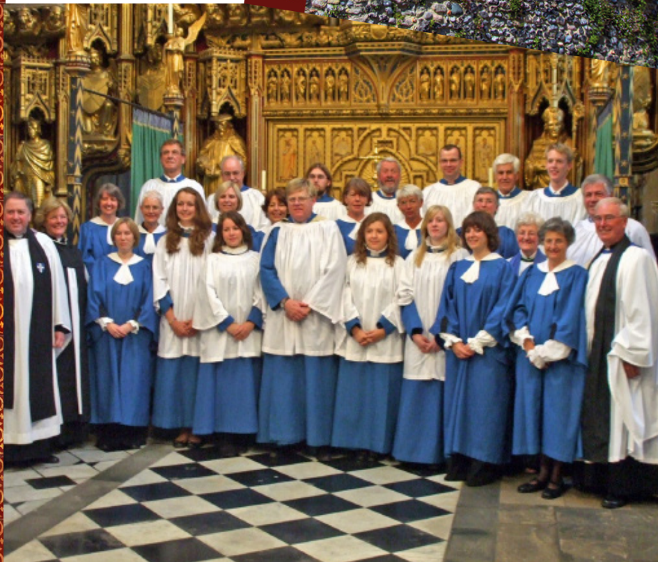
St Clement's Church Choir on their visit to Southwark Cathedral in 2008